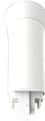
G24Q base Vertical