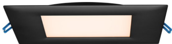
Type IC, Wet & Air-Tight

6" Square Recessed LED With Integral Driver In Connection Box Fits Where No Other Recessed Fixture Can